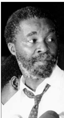
Top left: ‘At one o’clock I was in Lusaka and at three o’clock I was in Cape Town.’ Thabo Mbeki comes home from exile, 28 April 1990, with fellow ANC leaders Ruth Mompati, Joe Slovo, Alfred Nzo and Joe Modise. See page 572.