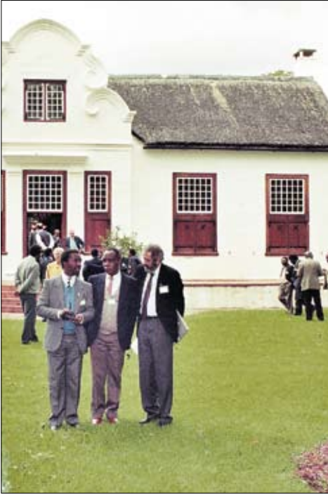
Left: Thabo Mbeki, Joe Nhlanhla and Aziz Pahad at the ANC's preparatory meeting before its first talks with the government, Vergelegen, 29 April 1990. This photograph is on display at Vergelegen Estate, Somerset West. See page 573.